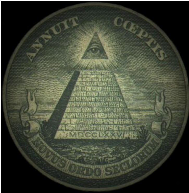
Illuminated Pyramid by unknown

Our shadow government consists of factions in a variety of agencies bound together in loose groups to further their common interests. These groups are ill defined and fluid but held together by enduring power structures and the rewards that beckon newcomers to ally themselves with entrenched factions.